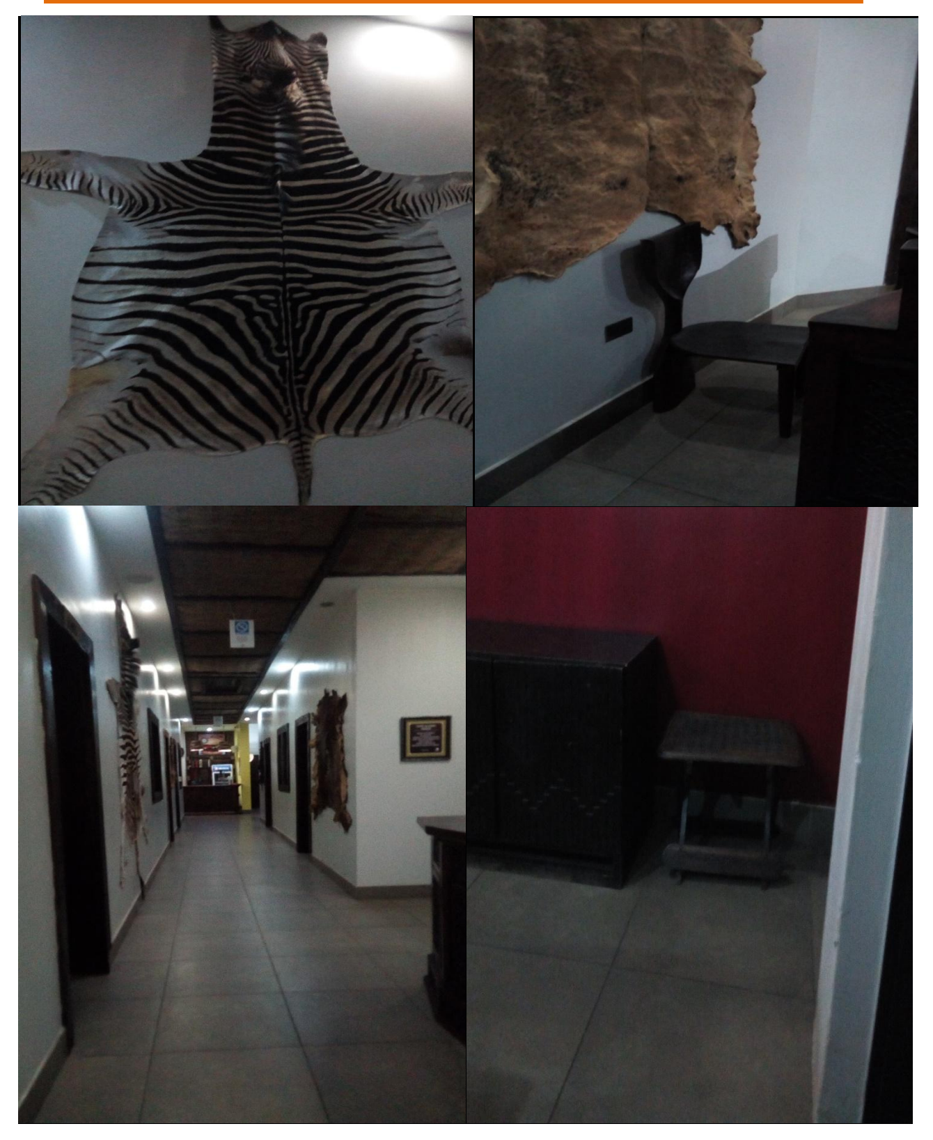
Figure 10. First floor lobby of roots restaurant Enugu furnished with artefacts of animal skin.