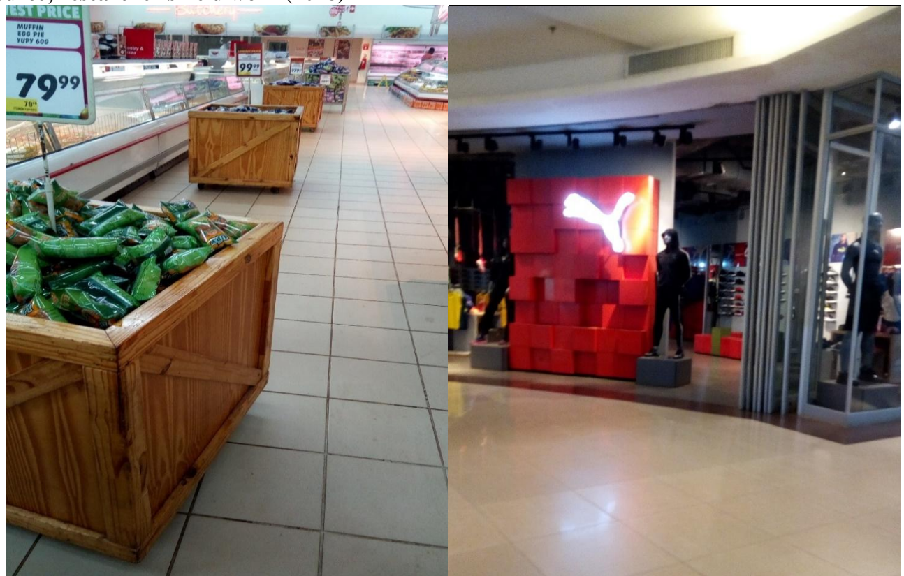
Figure 7. Interior shopping area of shop rite mall Enugu showing art work used within for displays