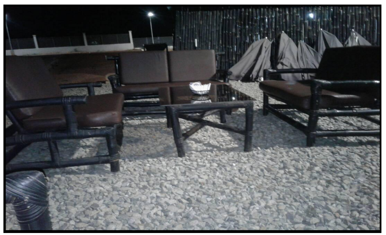
Figure 11. Outdoor eating area of Spar shopping centre Enugu DISCUSSION

Peer Reviewed Refereed Open Access International Journal - Included in the International Serial Directories Indexed & Listed at: Ulrich's Periodicals Directory ©, U.S.A., Open J-Gage as well as in Cabell's Directories of Publishing Opportunities, U.S.A