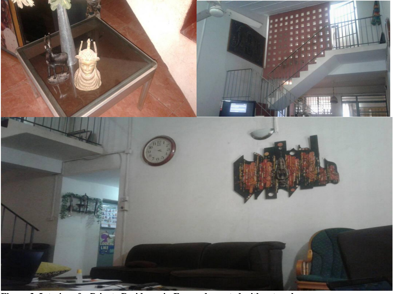
Figure 3. Interior of a Private Residence in Enugu decorated with artworks.