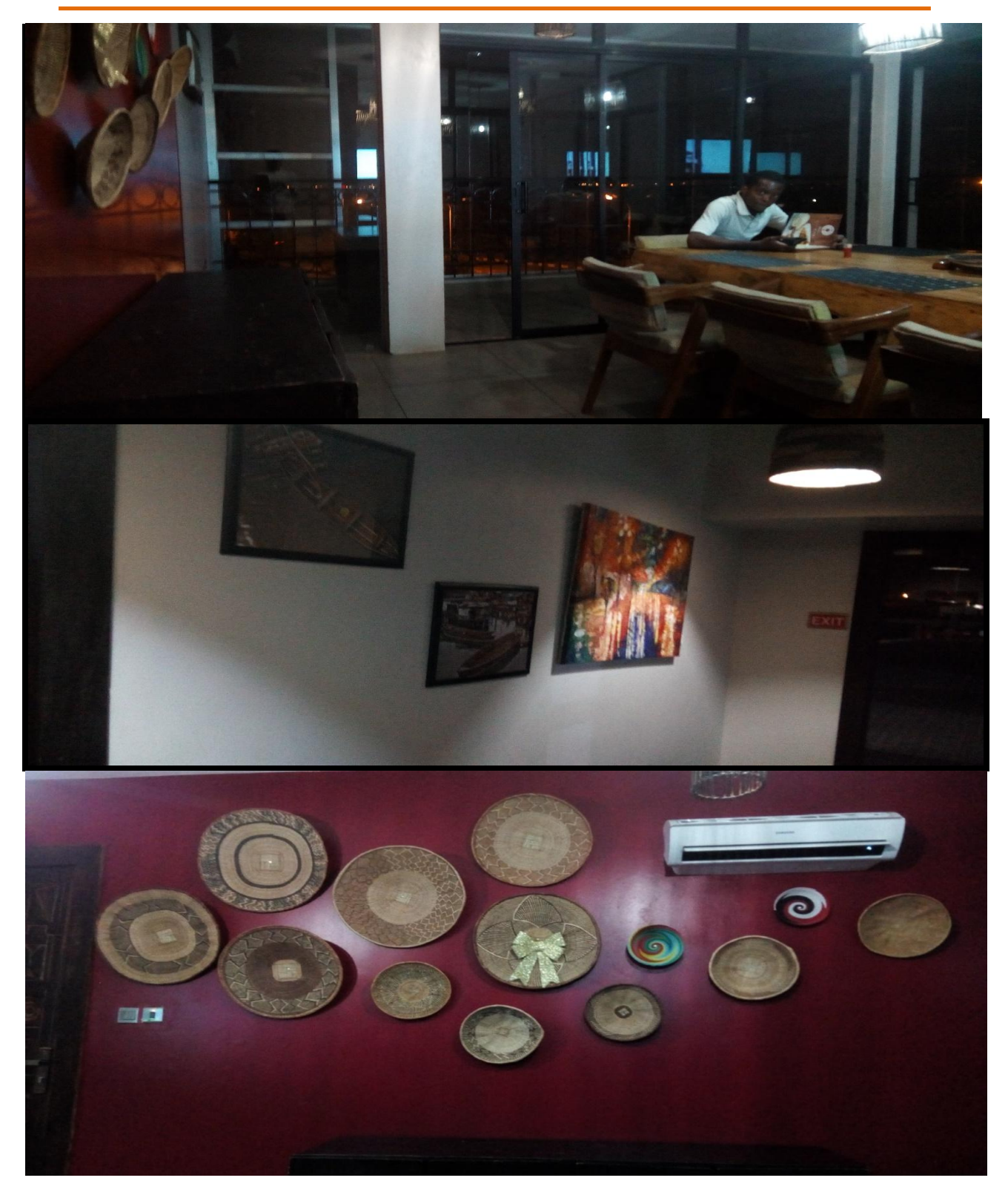
Figure 9. Interior private dining of roots restaurant Enugu furnished with Africana arts and artefacts

Peer Reviewed Refereed Open Access International Journal - Included in the International Serial Directories Indexed & Listed at: Ulrich's Periodicals Directory ©, U.S.A., Open J-Gage as well as in Cabell's Directories of Publishing Opportunities, U.S.A