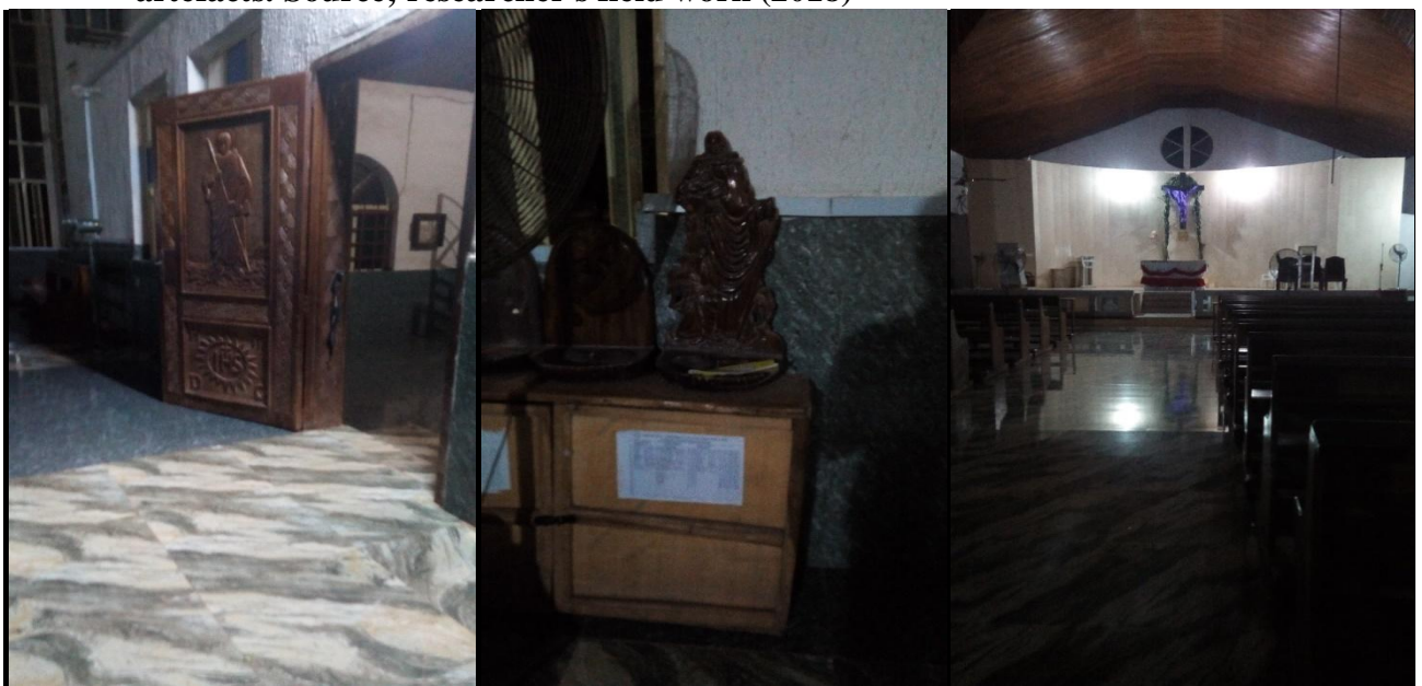
Figure 6. Interior scape of St. Mulumba catholic Chaplaincy University of Nigeria Enugu Campus showing the beautiful scared art works.

Figure 5. Outdoor siting of a Roots Restaurant Enugu showing the elaborate embellishment with artefacts.