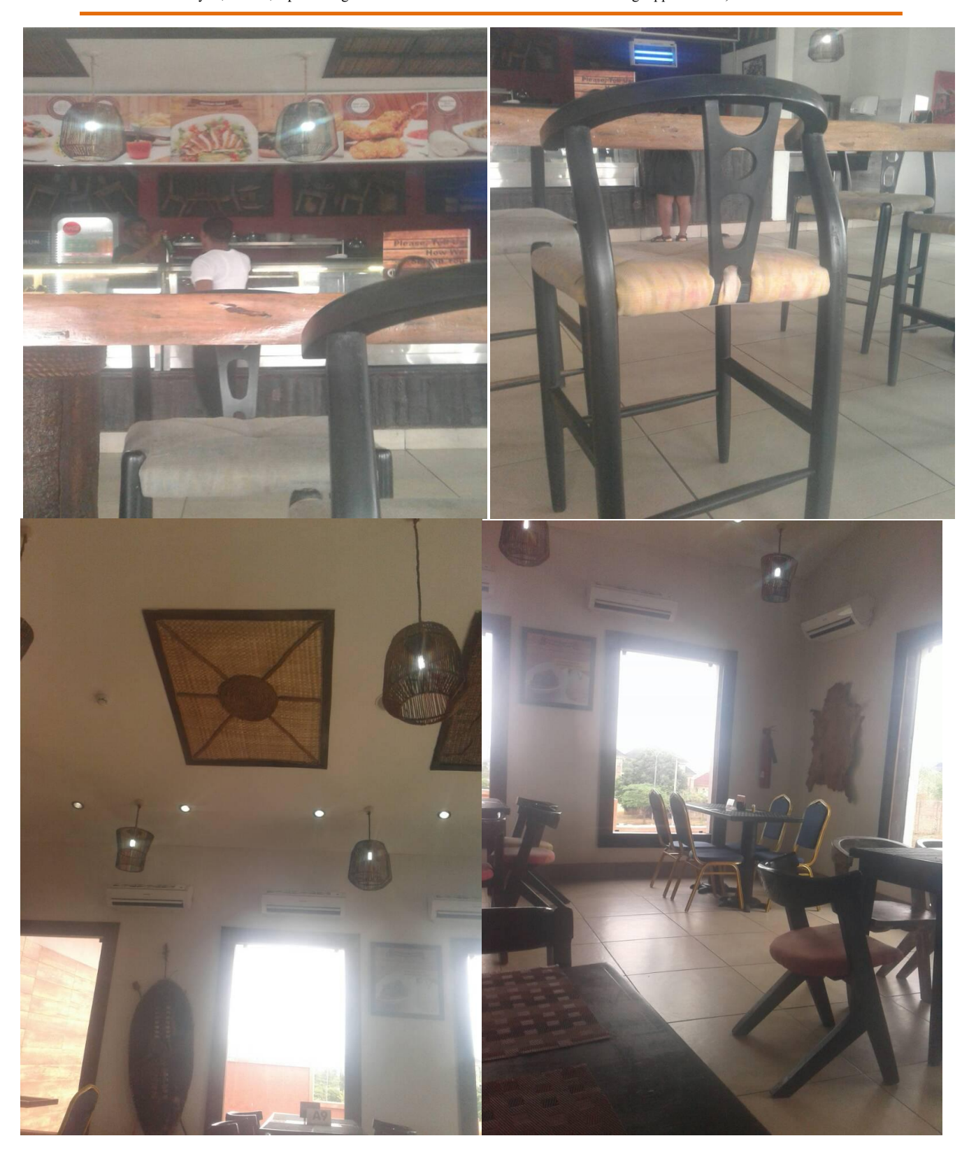
Figure 4. Interior eating area of Roots Restaurant Enugu State with hand crafted furniture.