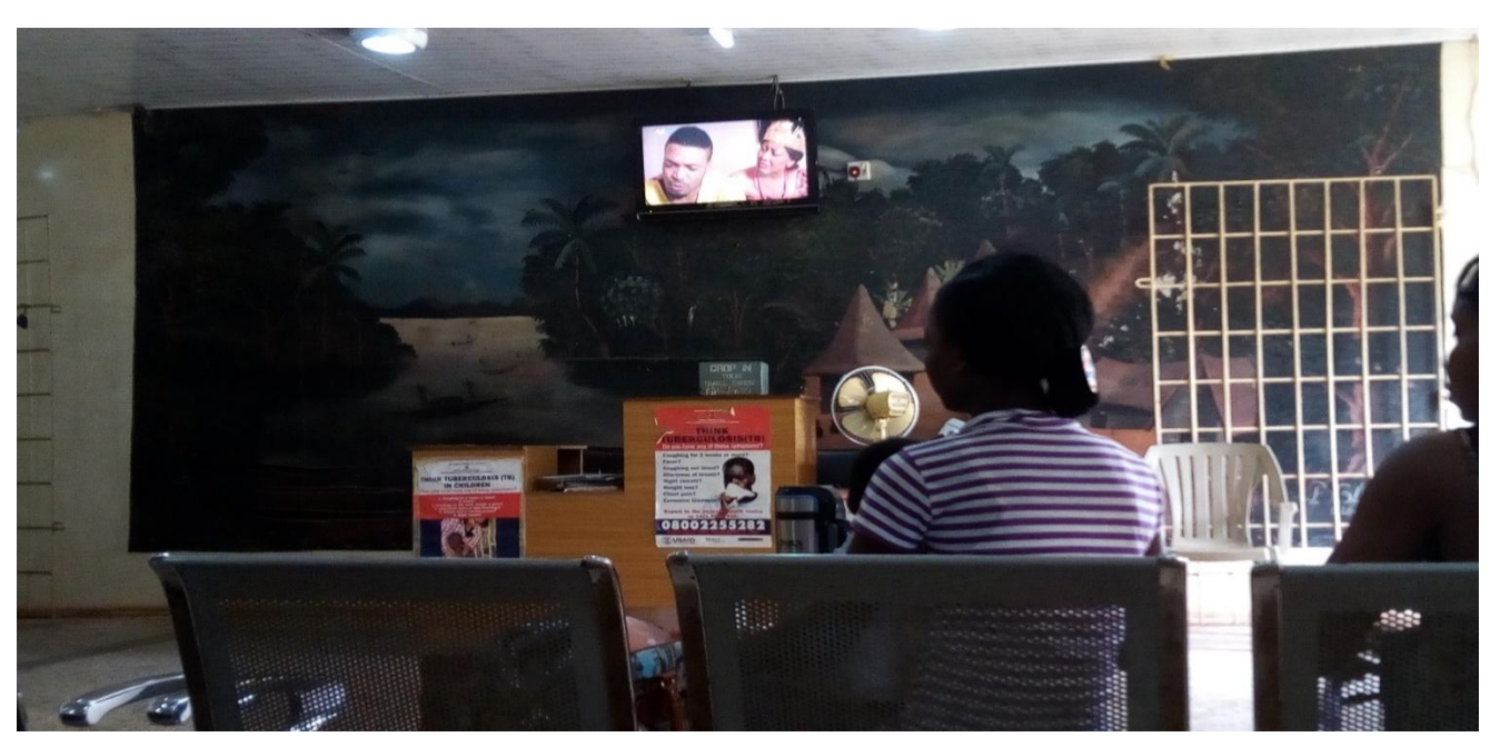
Figure 2. Interior of OPD of eastern medical centre Enugu with painting on reception wall