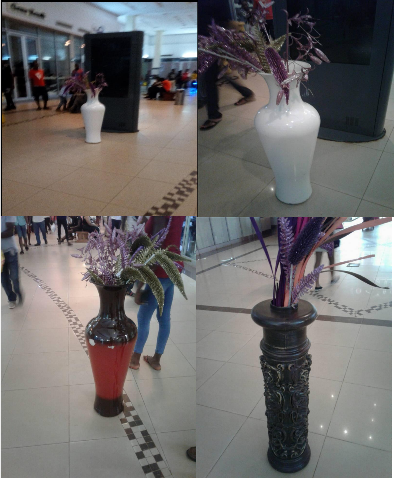
Figure 8. Interior of a view of Shoprite lobby decorated with art vase